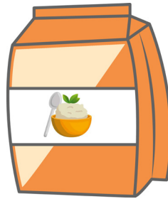
mashed potato mix