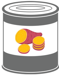
canned sweet potatoes