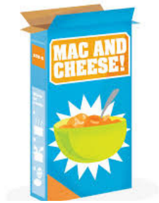
mac 'n cheese