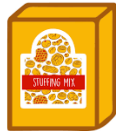
cornbread/ stuffing mix