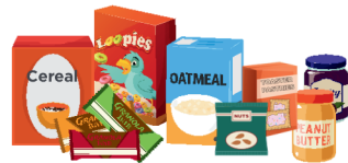
Breakfast Items (cereal, granola bars, instant oatmeal, toaster pastries) and Peanut Butter (Low sugar/whole grain options preferred)