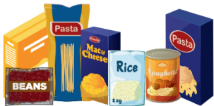
Meal Entrees (Hamburger Helper, pasta skillet meals, canned pasta meals), Rice, and Dry Beans (Whole grain options preferred)