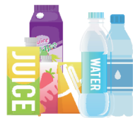
100% Juices, Juice Boxes, & Water