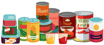
Canned Meats, Vegetables, Fruits, and Soup (Low sodium/low sugar options preferred)

Below is a collection of the most needed items for our programs. As a general rule, we are looking for non-glass, shelf-stable foods.